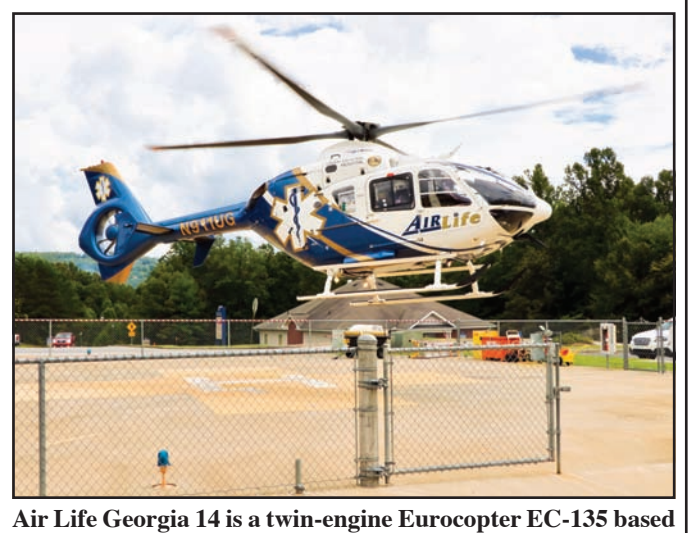
at Union General Hospital in Blairsville.

effective date. And this blanket agreement for all county residents includes everyone who lives in or has a home in the county, such as those listing Union as their primary residence, as well as parttime residents who own covers residents who are homes here prior to the June 1