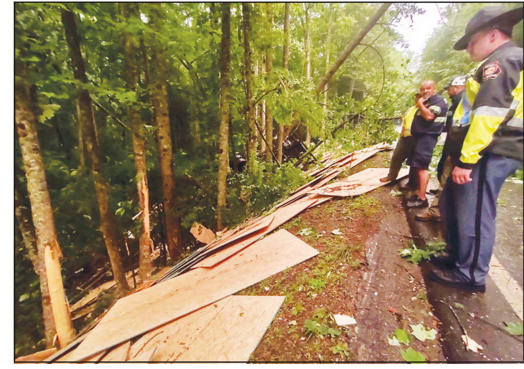
First responders surveying the roadside debris from last week's truck wreck on Richard Russell Scenic Highway.

There was no cellphone service available to call for help, so Montgomery ran back up to the road to flag someone down to drive ahead to contact emergency services.